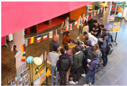
Erasmus Days: a time to introduce Erasmus Partners and exchanges

Jeunes Ambassadeurs: a program of coaching between a local business person and an international student